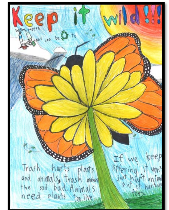
Jim Claypool Art Contest County Winner Artwork by: